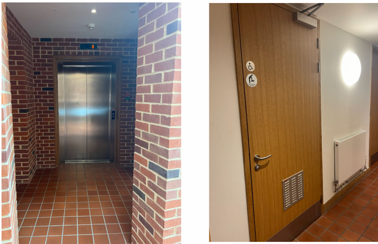
Figure 2. Accessible lifts in the main venue (left), accessible lavatory (right).