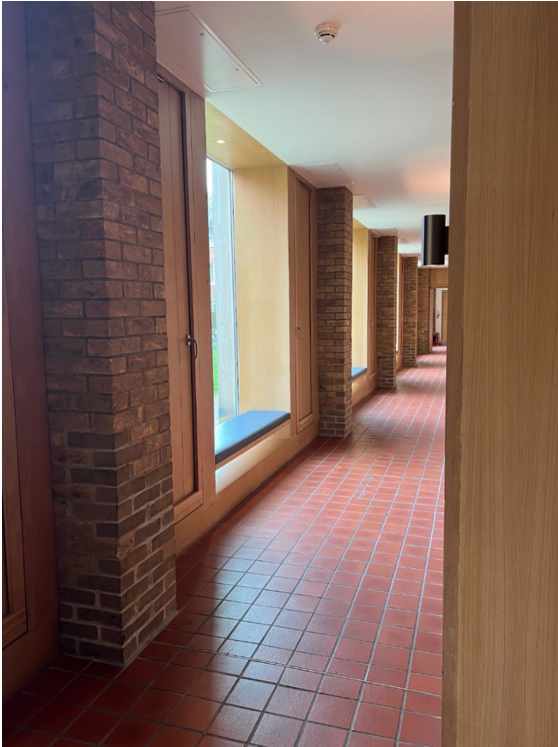
Figure 4. Window seats in a quiet corridor