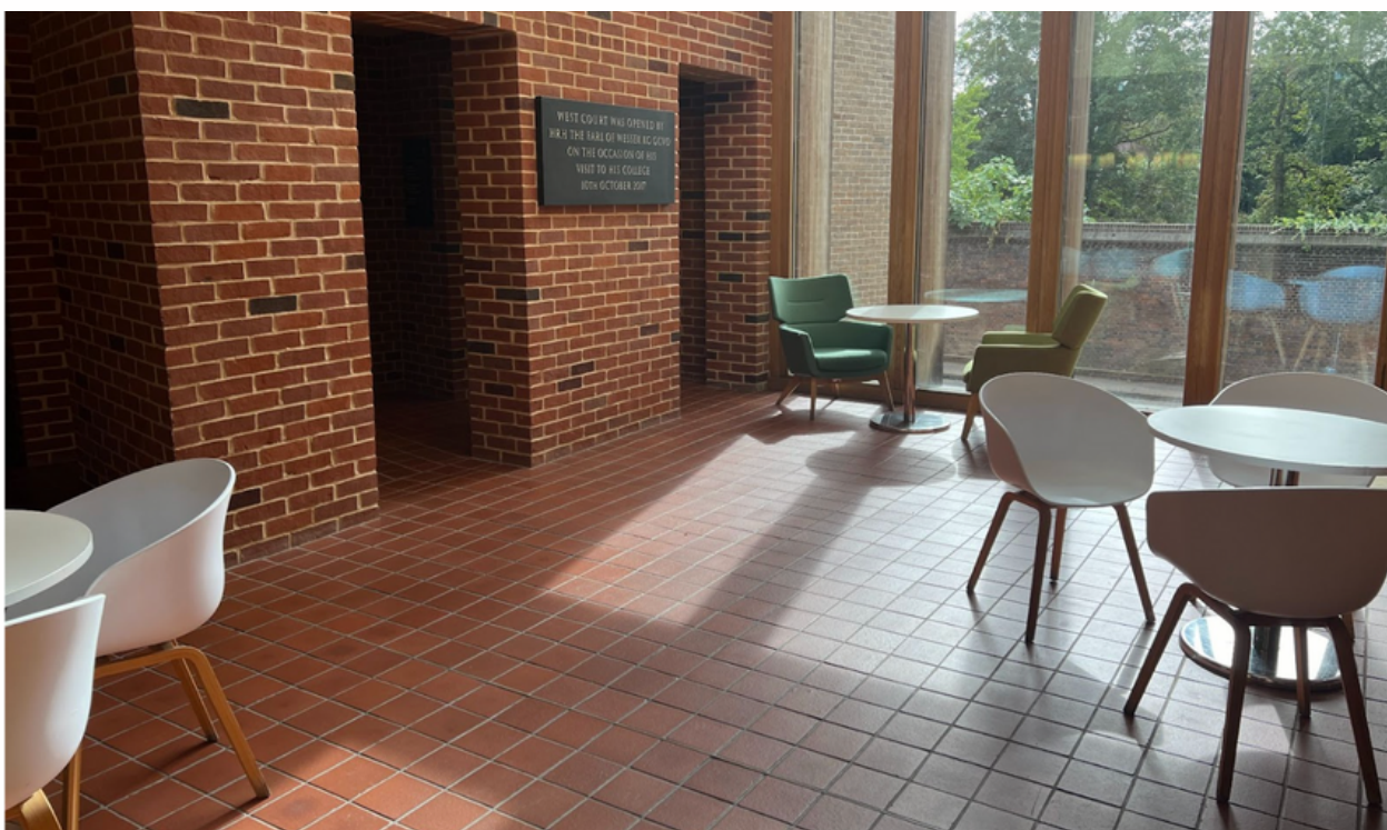
Figure 3. 1st floor of West Court with tables and chairs.