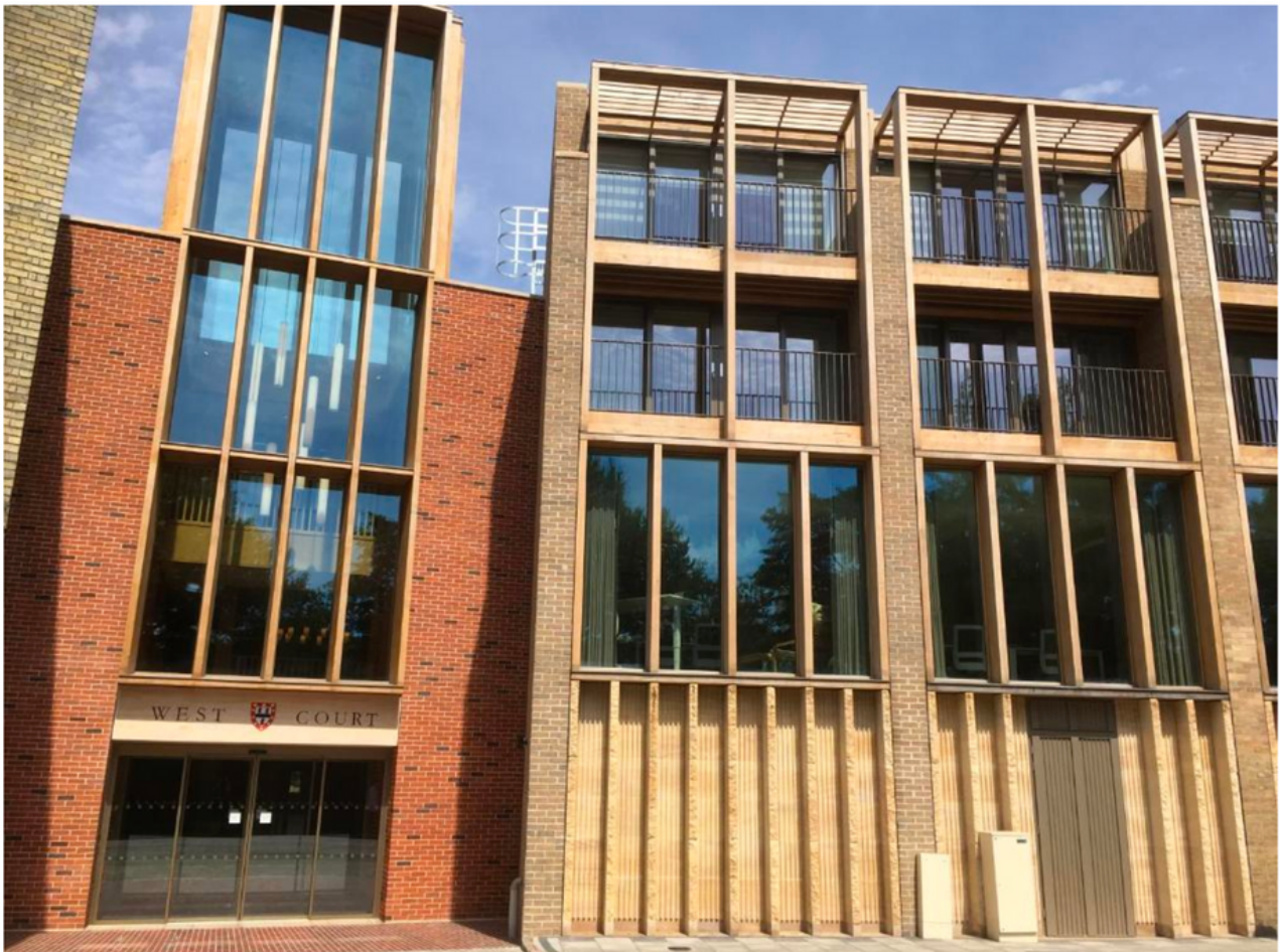
Figure 1. Jesus College West Court Entrance

For pedestrians or those alighting from buses or taxis it is best to use the Jesus Lane entrance. Once on Jesus Lane, we are near the Park St intersection. Look for the entry in the photo below (Figure 1). Blue Badge parking is across the intersection across from the AMC theatre. Cars should use the electronic gates on Victoria Avenue, where assistance is provided through an intercom.